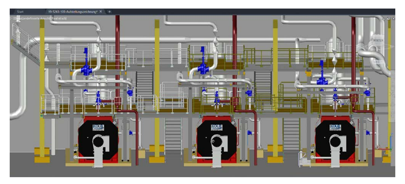
The new boiler house as a 3D visualisation. The Kolb Anlagenbau team was able to exactly represent the real conditions based on 3D laser scans and integrate the new system into the existing steel construction.

was completed step by step. Each time an old boiler was removed, a new Bosch boiler took its place. The compact design of the new heat generators was a very important factor here. It made it possible for the integration of the new system – which often required precision work – to be completed without costly external measures such as installation via the roof. Kolb installed roughly 250 metres of new piping in the heating plant for connecting the boilers.