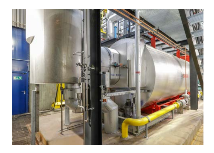
Reliable. Low in emissions. Efficient.