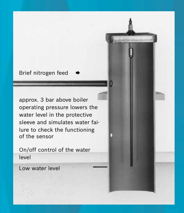
Figure 2: simple electrode – mandatory daily test through blowing in nitrogen.