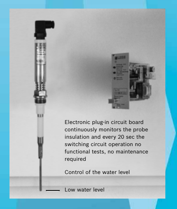
Figure 4: Self monitoring probe water level monitor - no maintenance, no functional test required