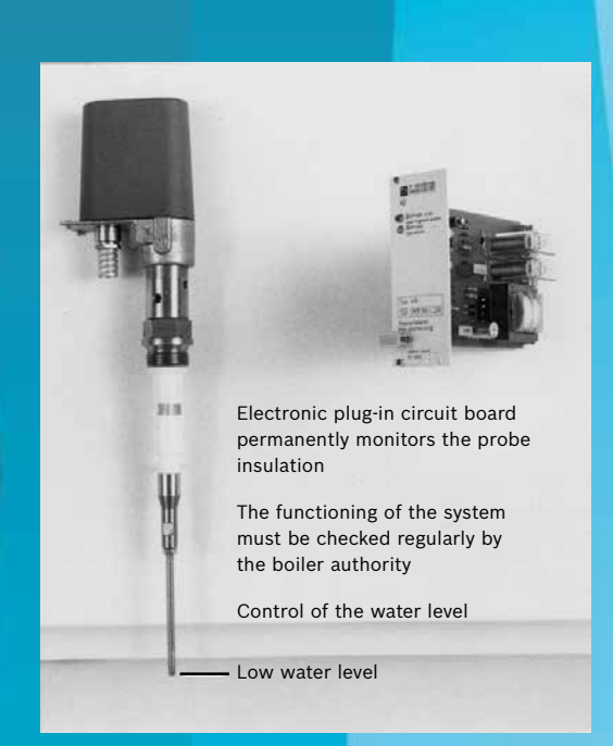
Figure 3: Two-channel probe water level monitor - the operation of the system must be checked regularly by the boiler inspection authority

These limiting devices generally have a complex sensor with an electric switching arrangement which continuously monitors the probe for insulation shortcircuit, as well as continuously checking the correct operation of the safety function of the electrical switching arrangement as such at intervals of approx. 15 - 20 seconds. With these arrangements the daily check of the equipment is dispensed with, as are the regular inspections by the inspection authority. These Installations are as a rule checked for correct operation by the boiler manufacturer's aftersales service simply by pressing test buttons provided for that purpose.