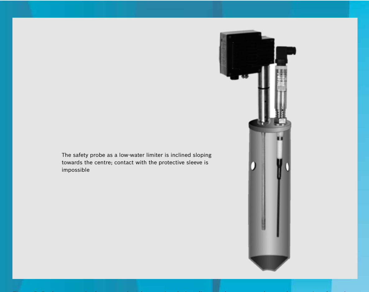
Figure 5: Probe system in the protective sleeve – insulation distance between probes and protective sleeve is permanently guaranteed