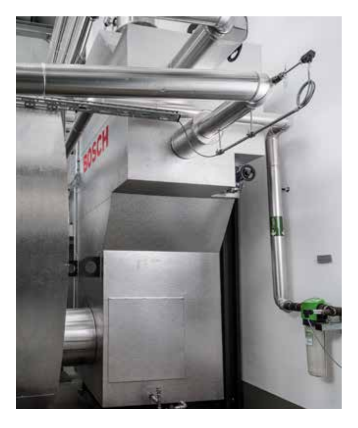
Figure 2: UNIVERSAL steam boiler with ECO 1 Stand-Alone for 1 - 28 t/h steam capacity