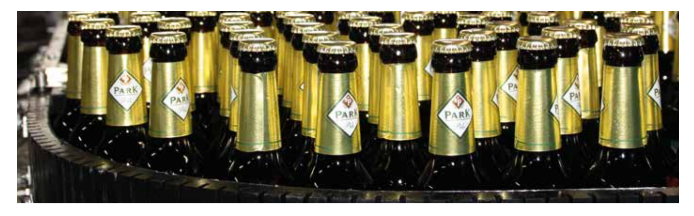
Decades of traditional brewing mainly using raw materials from the local area preserve the unmistakable taste of Park & Bellheimer's specialist beers.

the people living in the western and southern areas of the Palatinate region are reflected in the unmistakable taste of their specialist beers. "We mainly supply our beers to purchasers within 80 kilometres of our brew-