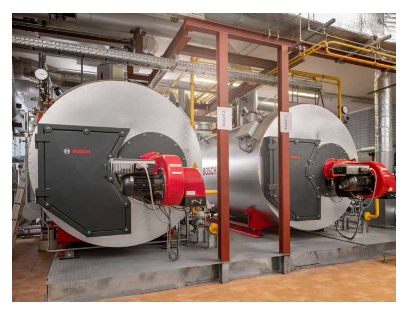
The Bosch boilers in Bellheim supply the brewery for processes like mashing and boiling. A cascade control ensures exceptionally cost-effective operation of the multi-boiler system.

All three boilers are equipped with integrated economisers that pre-heat the feed water, thereby enabling fuel savings of up to 7 % per boiler. High steam generator efficiency is especially important in the partial-load range, in order to ensure flexible adjustment to seasonal variations in production quantities and beverage types. The natural gas burners fitted at the factory work on a modulating basis and variably adapt to the current steam requirements. The speed-controlled burner fans have another positive effect: They reduce energy consumption by up to 75 % and their initial cost is paid off in an exceptionally short time. The fan speed is reduced depending on the current burner capacity, resulting in significantly lower electrical power consumption. Bosch control technology also forms a key part of both