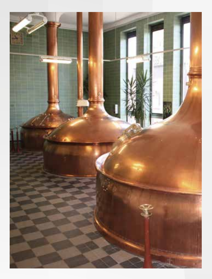
Brewery house Bellheim