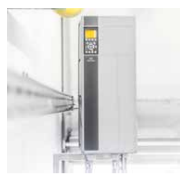
Speed control for low power consumption.