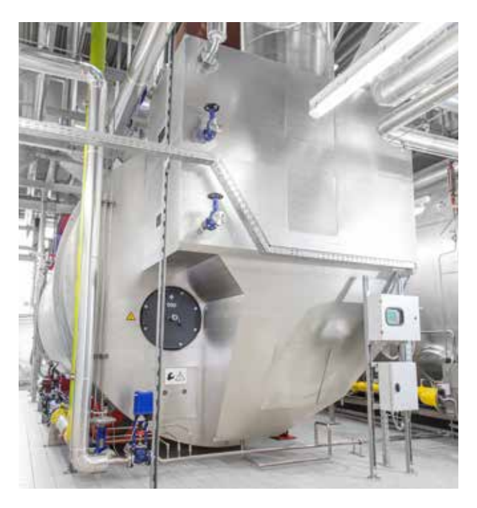
Effective use of waste heat with integrated economizer and flue gas heat exchanger.

A large control range of 1:7 and speed control ensure an energy optimized operation of the burner and fan.