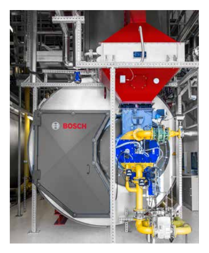
Energy-efficient Bosch steam boiler UL-S with air preheating system and twin-fuel firing system.

The modulating operation allows a seamless adaption to the current steam demand. Energy losses caused by frequent switching on and off of the burner can be avoided. The motor speed is adjusted flexibly to the actual burner output by means of the speed control. The result is reduced power consumption and noise-reduced operation.