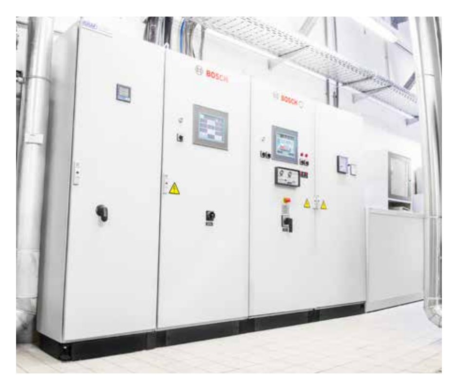
Bosch control technology ensures a high level of data transparency.

The sequence control in the management system SCO optimises service life by intelligently switching on and off the primary and follow-in boiler. Operating messages and up-to-date process data from the system are transmitted via an industrial Ethernet connection to the process control centre. A remote service connection provides quick support by the Bosch customer service.