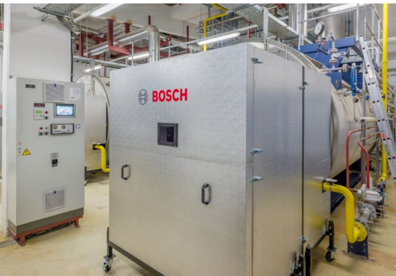
Modern Bosch technologies supplement the existing steam boiler system – for higher efficiency, consistent automation and high reliability.

As a perfect addition, the retrofitted water analyser from Bosch provides all relevant data from the fully automated water analysis to the control system or MEC Optimize. When exceeding pre-set limit values or even at safety-critical conditions an alarm signal is activated. With the measured values chemicals are dosed as needed and savings generated due to lower desalting losses, reduced fuel use and water demand. Thanks to the continuous monitoring of the water parameters Octapharma not only saves time and money but also benefits from a reliable system protection.