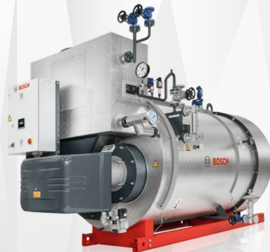
Image on the right Efficient and extremely compact: The new CSB steam boiler produces up to 5,200 kilograms of steam per hour.

Image on the left Digital and networked: Bosch presents smart services and efficient energy solutions for the commercial and industrial sectors at the ISH Energy 2019 trade fair.