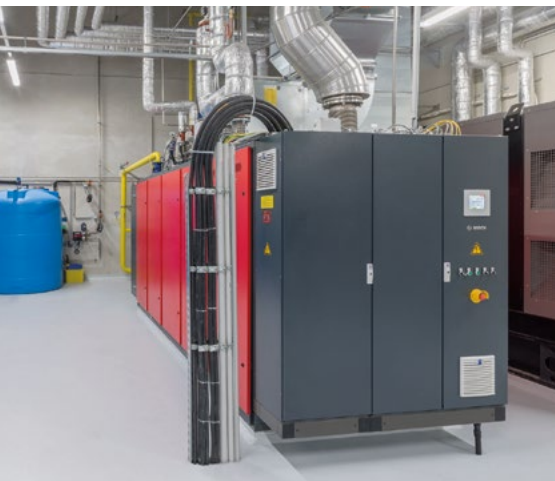
Combined generation of power and heat: Bosch combined heat and power units offer low energy costs and emissions.

Bosch offers reliable energy solutions in more than 140 countries worldwide. Typical applications include the food and beverage industry, production industry, energy suppliers and large buildings or public facilities. Availability, efficiency and seamless integration into the customer's processes are essential. Bosch demonstrates these qualities at the ISH trade fair at different information points. Additionally, visitors can see real boiler houses and energy centres from a range of industries using a 360° virtual reality headset.