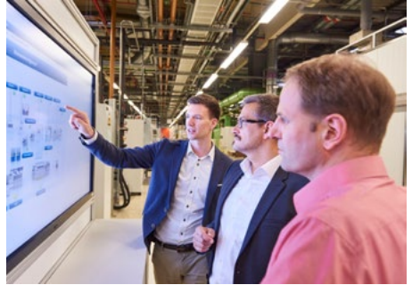
Future-proof production: Save money thanks to automation solutions and intelligent processing of energy and process data.

At the ISH 2019 the Bosch booth features the largest boiler of the entire trade fair. The ZFR double-flame tube boiler generates up to 55 tons of steam or up to 38 megawatts of hot water. Visitors can actually step inside the boiler or even go upstairs to the VIP lounge on its top floor. Besides the process heat systems, Bosch will also present innovative combined heat and power systems. In this sector, the customer focus is also on digitalisation through control technology or remote access in order to optimise reliability and operating costs. Bosch will show a combined heat and power unit from the latest motor generation. It is optimised to provide particularly high overall efficiency and future-proof low emissions. The compressed